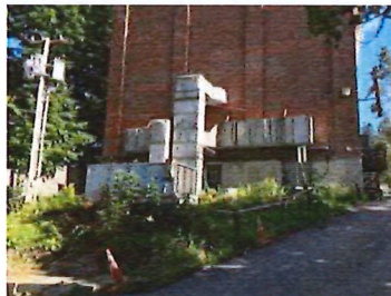
Systems at end of life