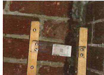
Large structural cracks